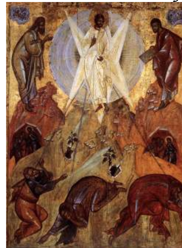
The Transfiguration, Russian Icon, 1403, Tretyakov Gallery, Moscow